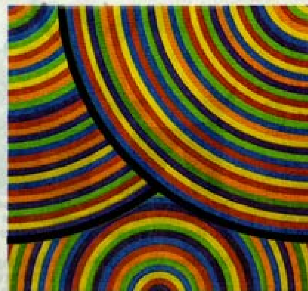
Sol LeWitt's linocut "Bands of Equal Width in Color" is part of Sol LeWitt: Editions and Structures, 1970-2005 at Carl Solway Gallery through Dec. 22.

Incorporating LeWitt's environment for backgrounds and using available light, she arranged fruits, vegetables and bottles. She sees the final images as a conversation across